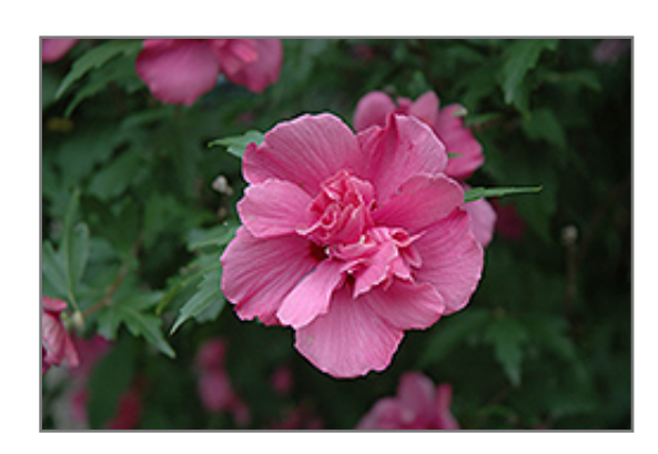
Lucy Rose Of Sharon flowers

A somewhat smaller version of this rigidly upright shrub featuring very showy double magenta-pink flowers over a long period; ideal for the mixed garden border or in mass plantings