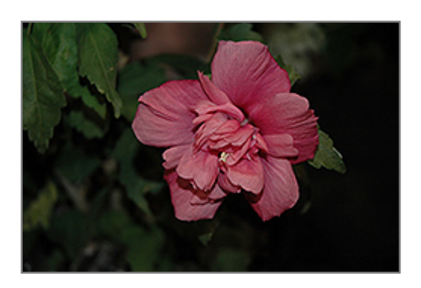
Freedom Rose Of Sharon flowers

While the flowers of many of the newer double-flowered varieties of this garden shrub can look a little ragged, this variety has notably cleaner purplish-pink flowers that retain their form a little better; a rigidly upright shrub for general garden use