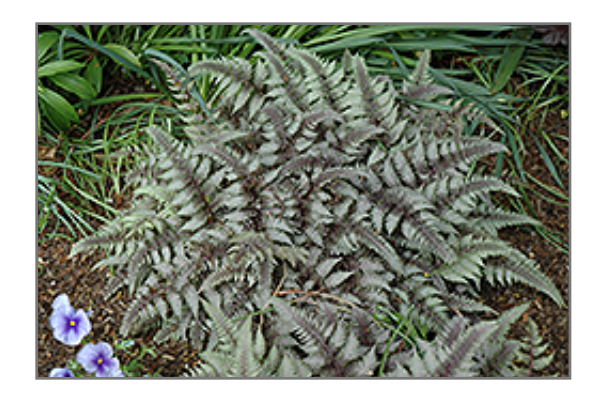
Burgundy Lace Painted Fern

This is a relatively low maintenance plant, and usually looks its best without pruning, although it will tolerate pruning. Deer don't particularly care for this plant and will usually leave it alone in favor of tastier treats. It has no significant negative characteristics.