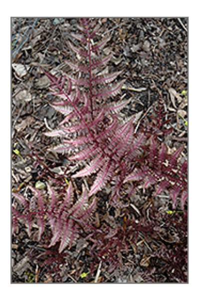
Burgundy Lace Painted Fern foliage

Burgundy Lace Painted Fern is recommended for the following landscape applications;