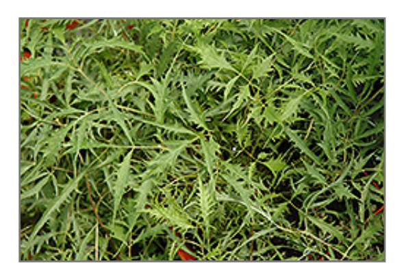
Cutleaf Goatsbeard foliage

Cutleaf Goatsbeard is recommended for the following landscape applications;