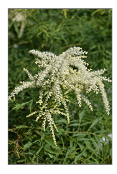
Cutleaf Goatsbeard flowers

This is a relatively low maintenance plant, and is best cleaned up in early spring before it resumes active growth for the season. It is a good choice for attracting butterflies to your yard, but is not particularly attractive to deer who tend to leave it alone in favor of tastier treats. It has no significant negative characteristics.