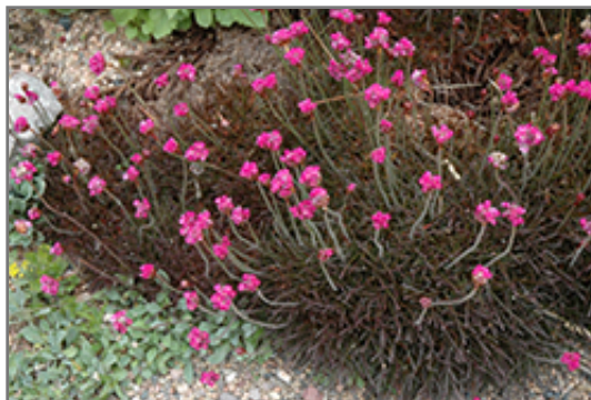
Red-leaved Sea Thrift in bloom