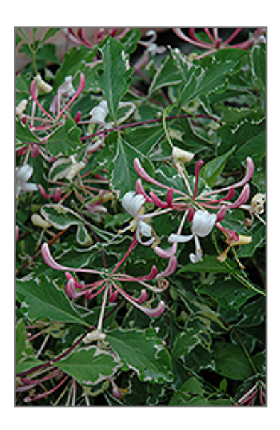
Harlequin Honeysuckle flowers