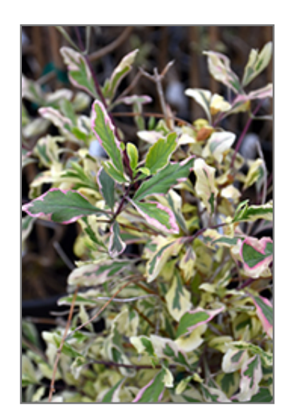
Harlequin Honeysuckle foliage