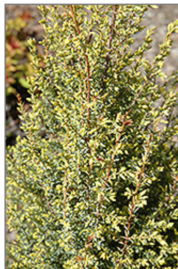
Gold Cone Juniper foliage