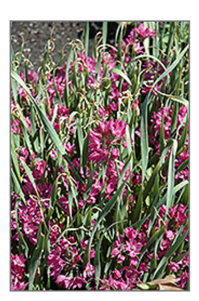
Pink Flowering Onion flowers

Lovely rosy-pink flower clusters are front and center of this beautiful ornamental onion; lightly scented flowers and foliage are in bloom from late spring to early summer; a wonderful addition to garden beds, borders and patio containers