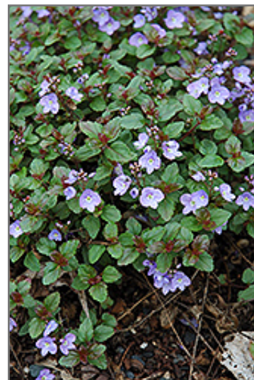
Waterperry Blue Speedwell in bloom