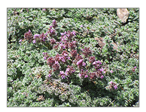
Wooly Thyme flowers