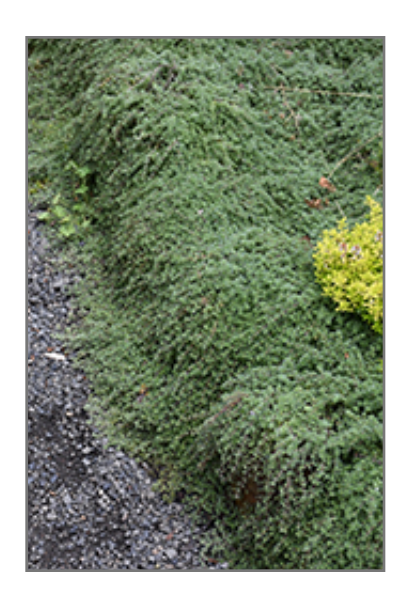
Wooly Thyme