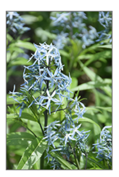
Narrow-Leaf Blue Star flowers