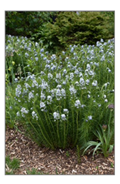
Narrow-Leaf Blue Star in bloom