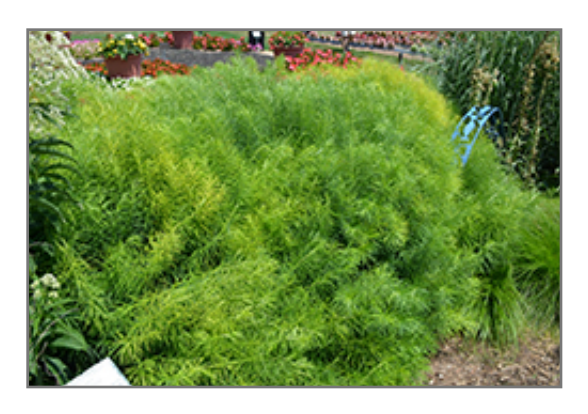
Narrow-Leaf Blue Star

This plant does best in full sun to partial shade. It prefers to grow in average to moist conditions, and shouldn't be allowed to dry out. It is not particular as to soil pH, but grows best in rich soils. It is quite intolerant of urban pollution, therefore inner city or urban streetside plantings are best avoided. Consider applying a thick mulch around the root zone over the growing season to conserve soil moisture. This species is native to parts of North America. It can be propagated by cuttings.