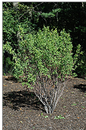
Rainbow Pillar Serviceberry

Rainbow Pillar Serviceberry is recommended for the following landscape applications;