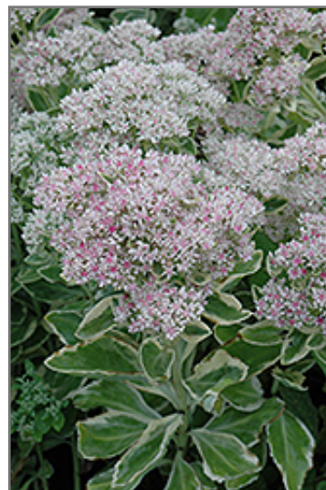
Frosty Morn Stonecrop flowers