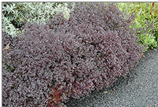
Bertram Anderson Stonecrop