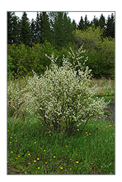
Honeywood Saskatoon in bloom