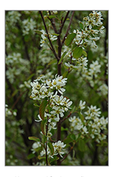
Honeywood Saskatoon flowers

Honeywood Saskatoon is blanketed in stunning clusters of white flowers rising above the foliage from early to mid spring before the leaves. It has dark green deciduous foliage. The oval leaves turn an outstanding yellow in the fall. It features an abundance of magnificent royal blue berries in early summer.