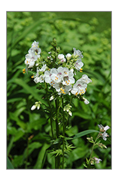
White Jacob's Ladder flowers

White Jacob's Ladder has masses of beautiful spikes of white flowers rising above the foliage from mid spring to mid summer, which are most effective when planted in groupings. The flowers are excellent for cutting. Its ferny pinnately compound leaves remain green in color throughout the season.