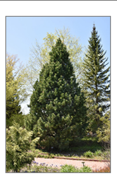
Swiss Stone Pine

An excellent landscape evergreen because of its dense, compact and columnar habit of growth; keeps its lower branches longer than other pines, becoming more open and picturesque at maturity; hardy and adaptable to dry soils, but slow growing