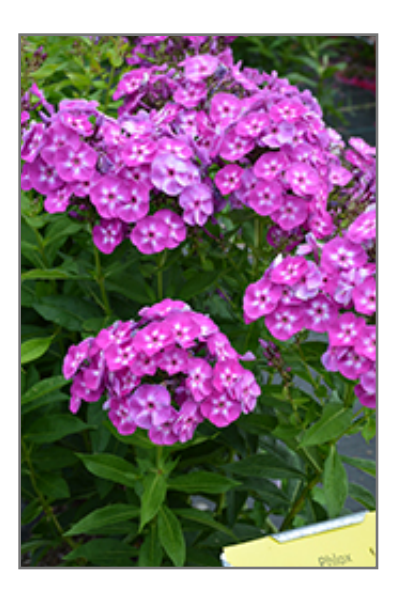
Laura Garden Phlox flowers

Laura Garden Phlox features bold fragrant conical lilac purple star-shaped flowers with white eyes at the ends of the stems from early summer to early fall. The flowers are excellent for cutting. Its narrow leaves remain green in color throughout the season.