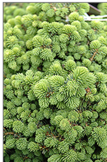
Little Gem Spruce foliage