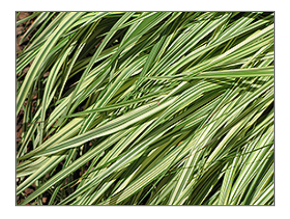
Variegated Moor Grass foliage