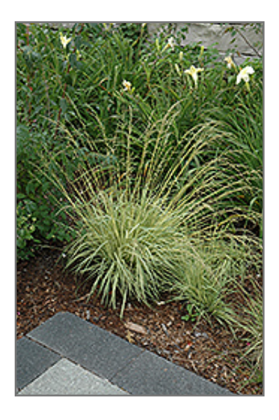
Variegated Moor Grass