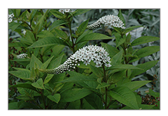
Gooseneck Loosestrife flowers