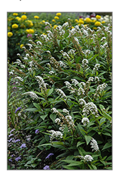
Gooseneck Loosestrife in bloom