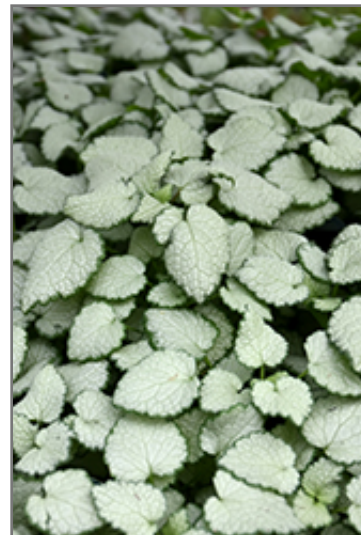
Red Nancy Spotted Dead Nettle foliage

Red Nancy Spotted Dead Nettle is a fine choice for the garden, but it is also a good selection for planting in outdoor pots and containers. Because of its spreading habit of growth, it is ideally suited for use as a 'spiller' in the 'spiller-thriller-filler' container combination; plant it near the edges where it can spill gracefully over the pot. Note that when growing plants in outdoor containers and baskets, they may require more frequent waterings than they would in the yard or garden.