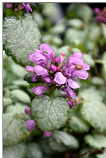
Red Nancy Spotted Dead Nettle flowers