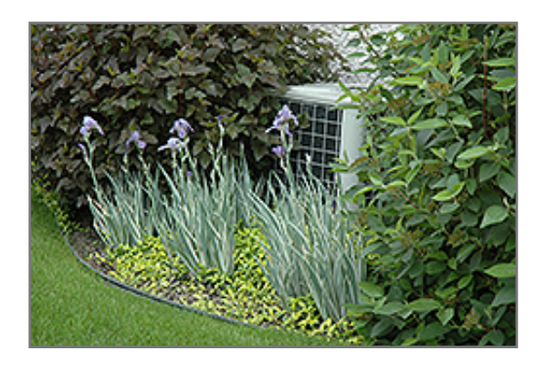
Variegated Sweet Iris

This plant will require occasional maintenance and upkeep, and should be cut back in late fall in preparation for winter. Deer don't particularly care for this plant and will usually leave it alone in favor of tastier treats. Gardeners should be aware of the following characteristic(s) that may warrant special consideration: