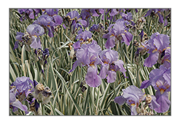
Variegated Sweet Iris flowers

Variegated Sweet Iris is an herbaceous perennial with an upright spreading habit of growth. Its medium texture blends into the garden, but can always be balanced by a couple of finer or coarser plants for an effective composition.