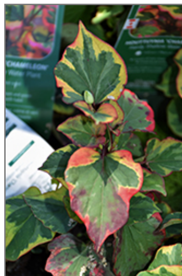
Variegated Chameleon Plant foliage