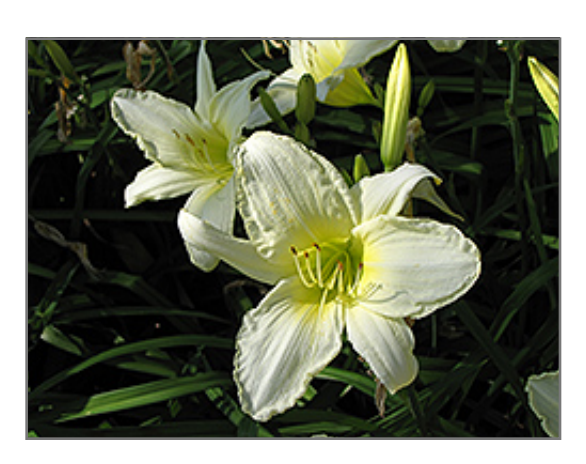
Ice Carnival Daylily flowers

Beautiful and elegant creamy white flowers with lightly ruffled edges and buttery yellow eyes rise above low growing mounds of arching green foliage; drought tolerant once established, great in perennial borders and beds; lovely addition to fresh bouquets