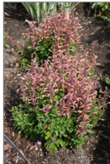
Mango Tango Hyssop in bloom