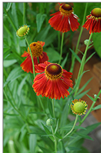
Moerheim Beauty Sneezeweed flowers

Moerheim Beauty Sneezeweed is recommended for the following landscape applications;