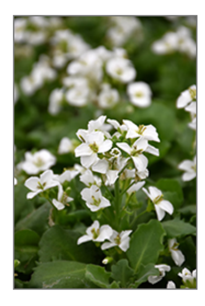
Lotti White Wall Cress flowers

A tightly uniform, compact mounded variety that is covered with fragrant white flowers in spring for several weeks; perfect for walls and rock gardens; can shear after blooming for best appearance