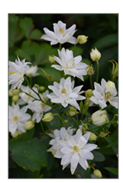
Clementine White Columbine flowers

Dainty, upward facing white flowers resemble double-flowering clematis; on a compact, many-branched plant; makes a welcome addition to shade and woodland gardens