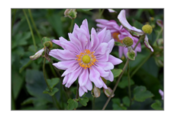
Alice Anemone flowers

Light pink semi-double buttercup flowers rise above dark green foliage on this compact selection; windflowers are perfect for naturalizing, swaying gently in the wind and blooming at the end of the season; should not need to be staked