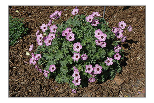
Ballerina Cranesbill flowers

Ballerina Cranesbill is recommended for the following landscape applications;