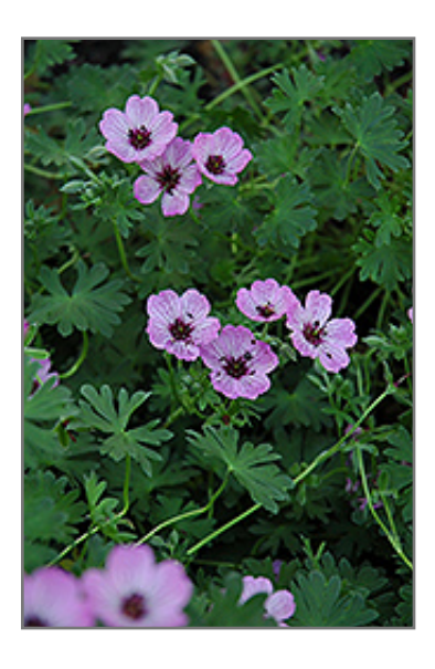
Ballerina Cranesbill flowers

This is a relatively low maintenance plant, and should only be pruned after flowering to avoid removing any of the current season's flowers. Deer don't particularly care for this plant and will usually leave it alone in favor of tastier treats. It has no significant negative characteristics.