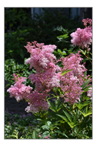
Venusta Queen Of The Prairie flowers