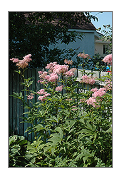
Venusta Queen Of The Prairie flowers