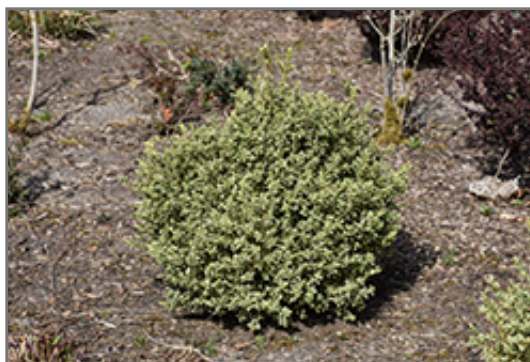
Wedding Ring Boxwood