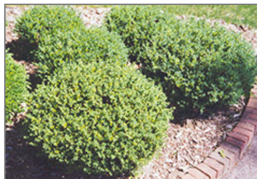
Japanese Boxwood