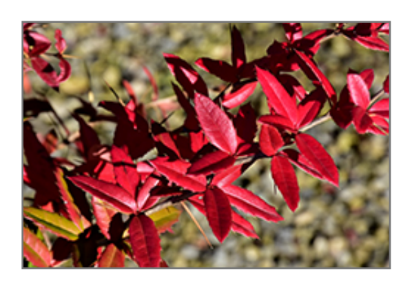
Wintergreen Barberry in fall

A beautiful shrub that looks rich on the landscape; red emerging foliage matures to deep green all summer, finally turning wine red in fall, also has attractive flowers and inconspicuous dark fruit in the fall