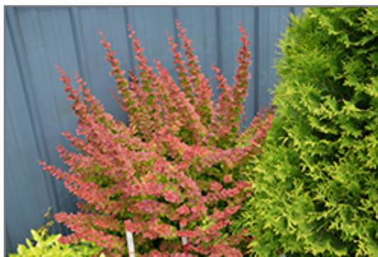
Sunjoy Tangelo Japanese Barberry