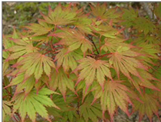
Sensu Full Moon Maple foliage