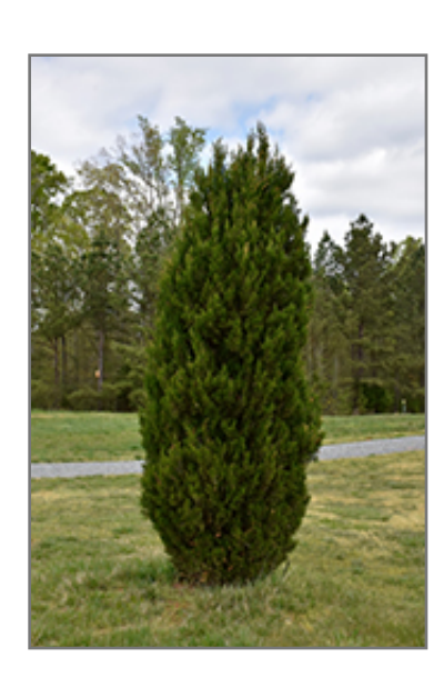
Spartan Juniper

Spartan Juniper is a dwarf conifer which is primarily valued in the landscape for its rigidly columnar form. It has emerald green evergreen foliage. The scale-like sprays of foliage remain emerald green throughout the winter. It produces powder blue berries from late spring to late winter.