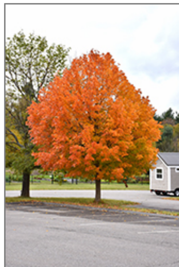
Sugar Maple in fall