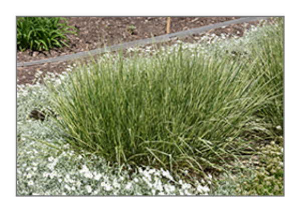
Variegated Reed Grass

Variegated Reed Grass will grow to be about 3 feet tall at maturity extending to 4 feet tall with the flowers, with a spread of 24 inches. It tends to be leggy, with a typical clearance of 1 foot from the ground, and should be underplanted with lower-growing perennials. It grows at a medium rate, and under ideal conditions can be expected to live for approximately 10 years. As an herbaceous perennial, this plant will usually die back to the crown each winter, and will regrow from the base each spring. Be careful not to disturb the crown in late winter when it may not be readily seen!