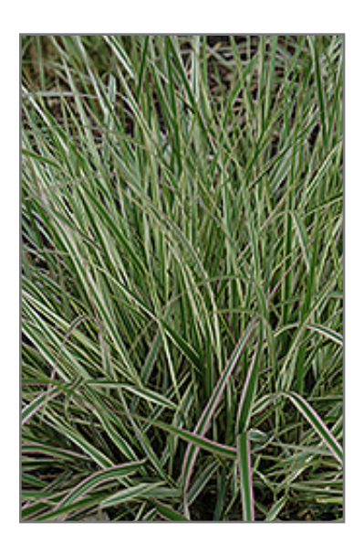
Variegated Reed Grass foliage