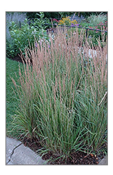
Variegated Reed Grass in bloom

Variegated Reed Grass is recommended for the following landscape applications;