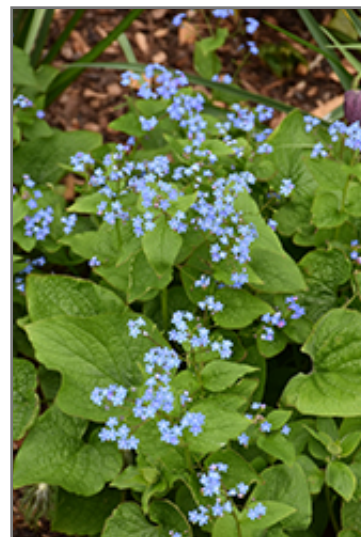
Siberian Bugloss flowers