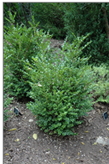
Jim's True Spreader Boxwood

Jim's True Spreader Boxwood will grow to be about 4 feet tall at maturity, with a spread of 4 feet. It tends to fill out right to the ground and therefore doesn't necessarily require facer plants in front. It grows at a slow rate, and under ideal conditions can be expected to live for approximately 30 years.