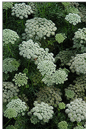
Green Mist Queen Anne's Lace flowers