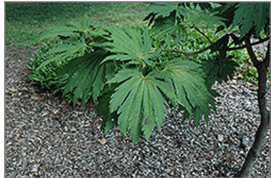
Yama Kagi Fullmoon Maple foliage