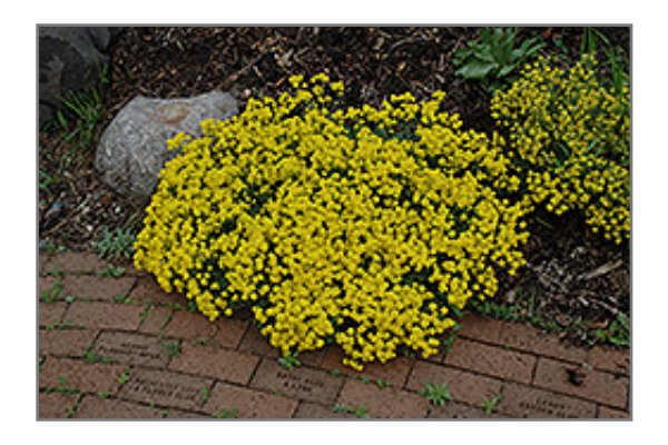
Gold Dust Basket Of Gold in bloom

Gold Dust Basket Of Gold is recommended for the following landscape applications;