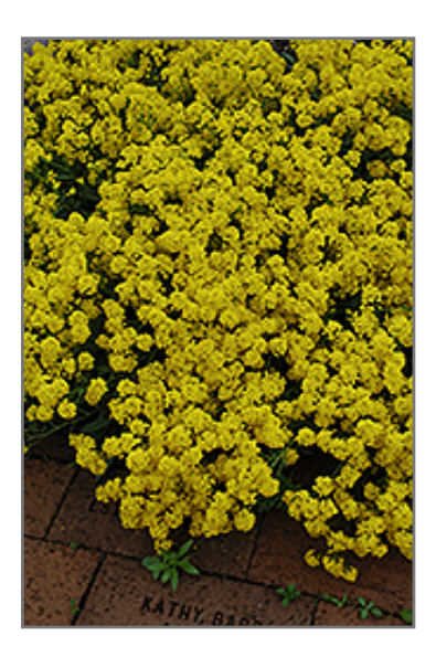
Gold Dust Basket Of Gold flowers

This is a relatively low maintenance plant, and is best cleaned up in early spring before it resumes active growth for the season. It is a good choice for attracting bees and butterflies to your yard. It has no significant negative characteristics.