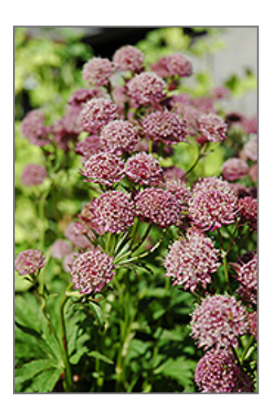
Hadspen Blood Masterwort flowers

A lovely selection that produces tall stems of ruby red pincushion flowers; upright selection featuring dark green, ferny foliage during the summer months; self-seeding, requiring some maintenance and pruning in the fall