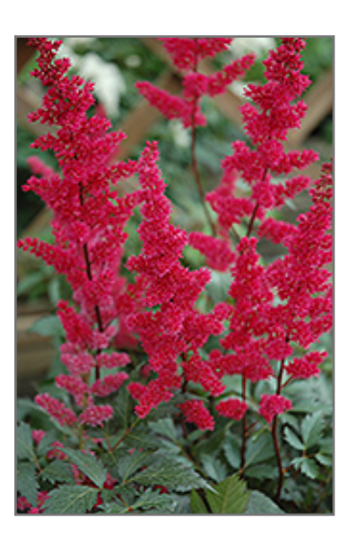
Fanal Astilbe flowers

This early summer bloomer produces tall stems of ruby red plumes that stand out in shaded gardens, borders or containers; vigorous upright habit with low mounding deep green foliage; easy to grow, requiring little to no maintenance; excellent freshly cut