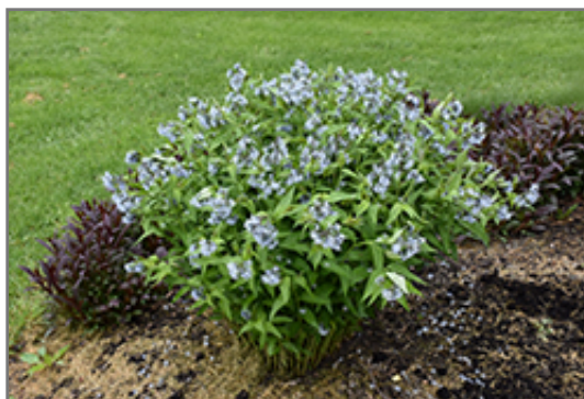
Blue Star Flower in bloom