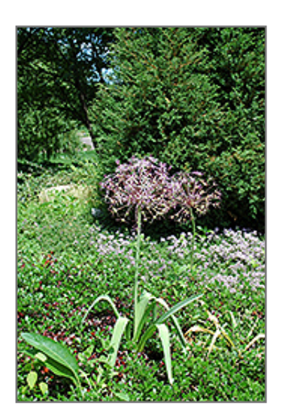
Star Of Persia Onion in bloom