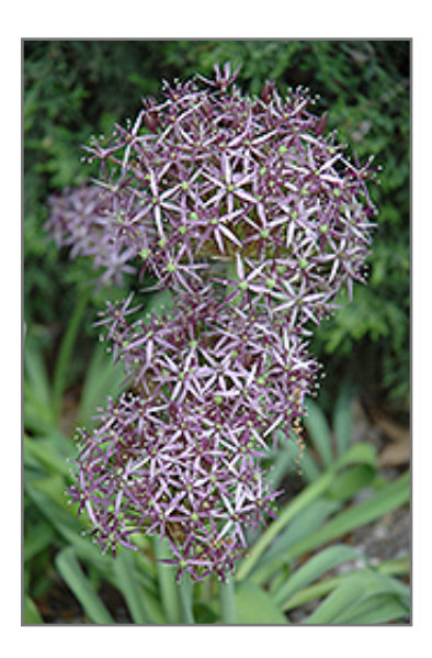
Star Of Persia Onion flowers