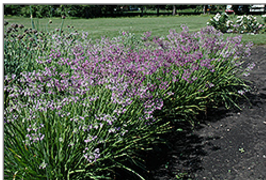
Nodding Onion in bloom